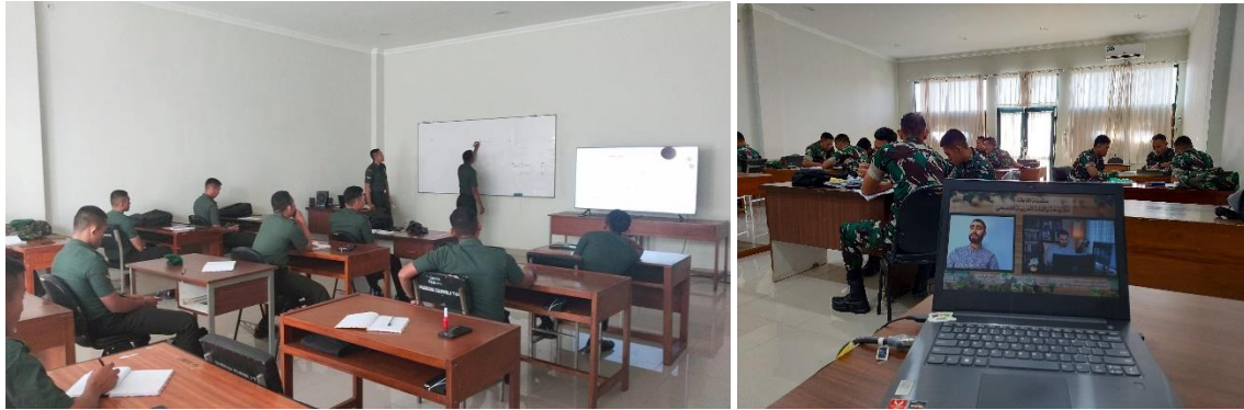
Figure 2. The Process of Learning Arabic in Military Education