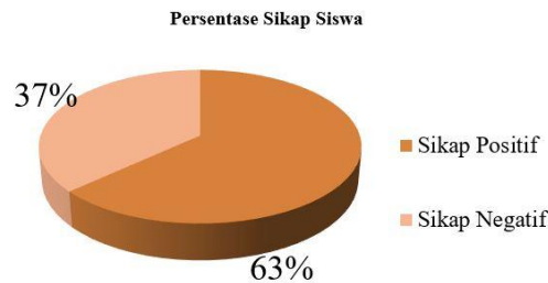
Figure 2. Percentage of Students' Attitudes to the Pair Check Model

Based on the diagram of the percentage of students' attitudes towards the Pair Check model, most of the students gave a positive response to the Pair Check learning model. This shows that most students are happy with learning mathematics with the Pair Check model, students are serious and active in participating in the learning process carried out, and students feel the benefits of the learning process. In Supriatna's research (2018), it was stated that the response of students to the Pair Check type of cooperative learning model resulted in a good response. In addition, the pair check type cooperative learning model in terms of mathematical reasoning and students' critical thinking got a positive response from students (Hujemiati, 2018)