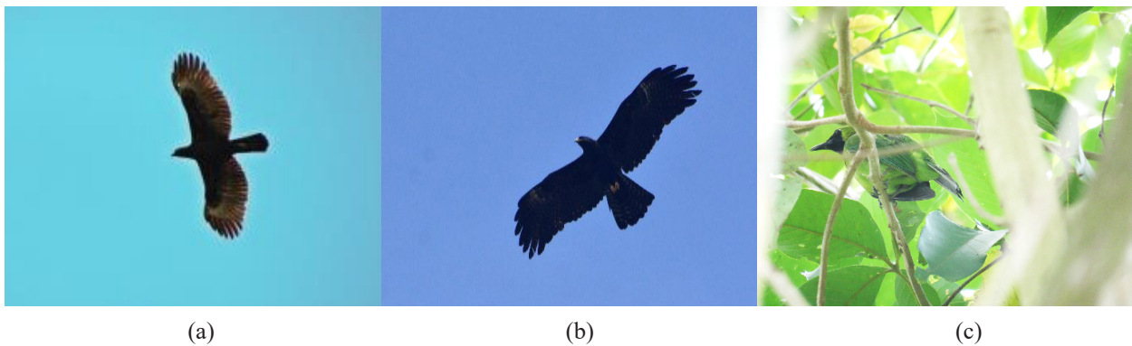
Figure 3. Species that potential as avitorism objetos. (a) Changeable Hawk-eagle, (b) Black Eagle, and (c) Blue-winged Leafbird.

in the type whose population is precariously close to endangered so that its trade controls are tight and regulated by strict rules. Besides that, the Changeable Hawk-eagle, Black Eagle, and Blue-winged Leafbird are protected by the Indonesian government. Utilization of these types, especially for breeders and trade must be based on permission by the Minister of Tourism. However, as long as these species are still free in nature, utilization like avitourism is permitted.