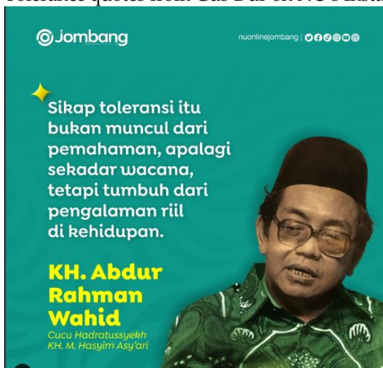
Figure 1. Tolerance quotes from Gus Dur on NU's Instagram