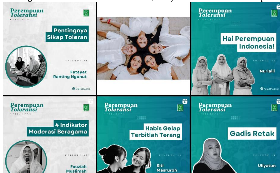
Figure 6. Content of Tolerant Women, Fatayat NU Central Leadership