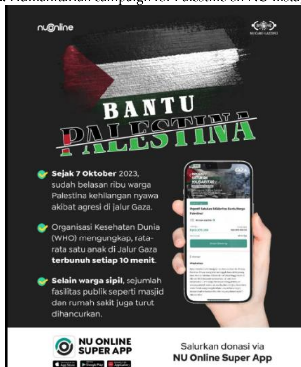
Figure 2. Humanitarian campaign for Palestine on NU Instagram

In addition to actively advocating for peace through various platforms, NU also plays an active role in providing humanitarian assistance, particularly to the Palestinian people. NU's commitment to creating a peaceful life for the Palestinian people is reflected through tangible efforts in providing aid and support. Content postings on NU's Instagram serve as one way to demonstrate their solidarity and support for Palestine to the wider community. Through these activities, NU not only expresses its role as a peace agent but also as a humanitarian agent committed to assisting those in need, underscoring the importance of humanitarian values in achieving sustainable and lasting peace.