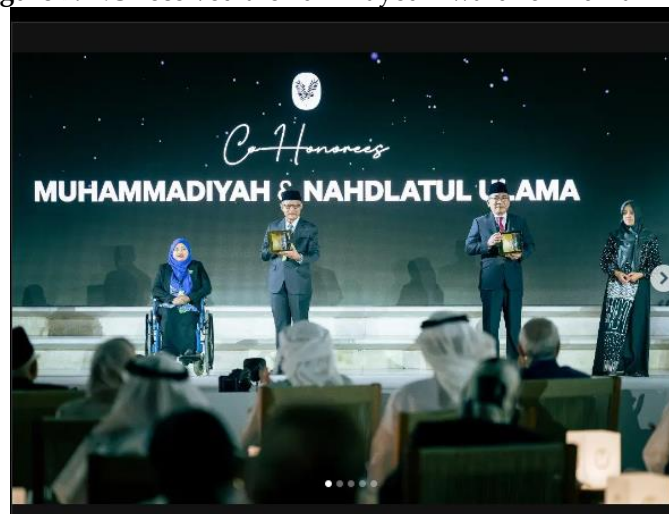
Figure 7. NU received the 2024 Zayed Award for Human Fraternity