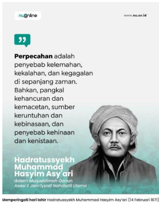
Figure 4. NU's inclusive content to avoid national division