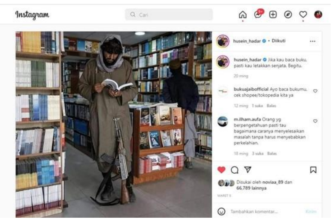
Figure 1. Posted by @husein_hadar on March 5, 2022 Table 1. Some Comments at content by @husein_hadar on March 5, 2022

Husein Jafar Al-Hadar's Islam Mazhab Cinta : Meaning and Media Analysis of Instagram Content @husein_hadar Norma Azmi Farida and Zainal Abidin