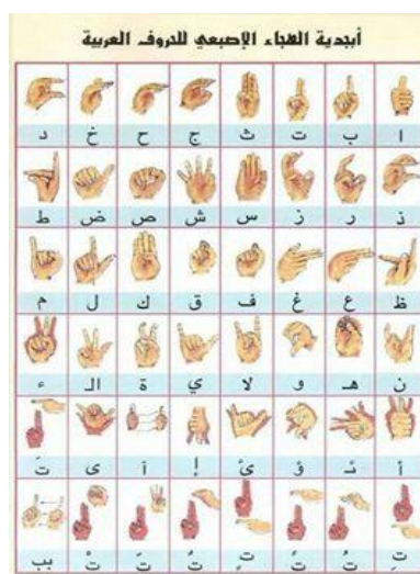
Figure 1. Sign Language Guide for Arabic Letters in Saudi Arabia ( https://id.pinterest.com/pin/333477547384829747/ )

The hijaiyah sign language guidelines used in several special schools in Bengkulu City is shown on Figure 1.