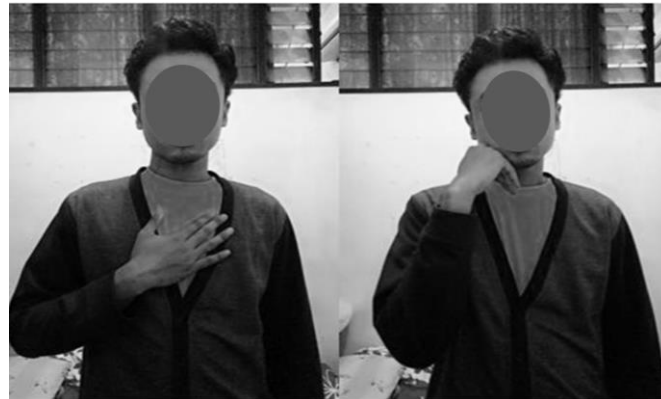
Figure 3. BISINDO Model used to Express “I am unemployed”

The method of spelling with the hijaiyyah sign language guidelines above is very suitable for deaf children in Bengkulu city because it is in accordance with the way they communicate using the BISINDO method. In BISINDO, the sentence “I am unemployed” is enough with two signs, namely a sign like someone who is lazy or doing nothing. Gestures communicated in BISINDO are always accompanied by natural expressions and circumstances. No wonder if its use is felt easier and more practical as shown in Figure 3.