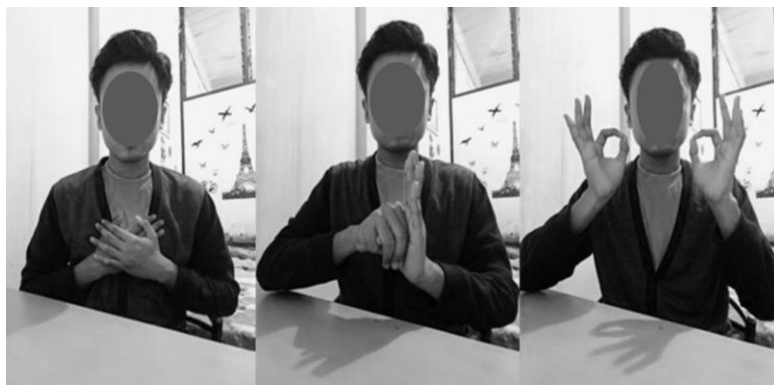
Figure 4. SIBI Model used to express “I am unemployed”