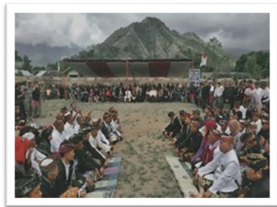
Figure 6. Siloturrahmi of Customary Elders