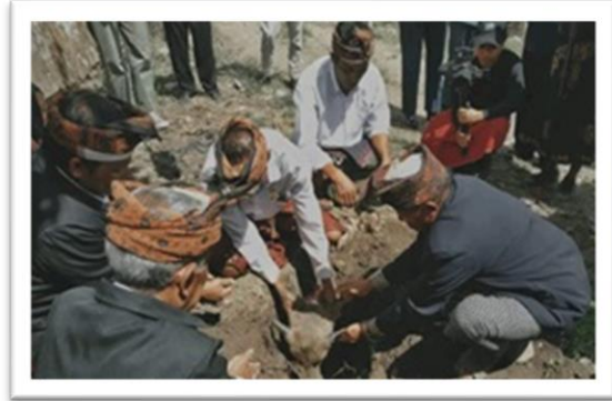
Figure 4. Planting of Buffalo Head