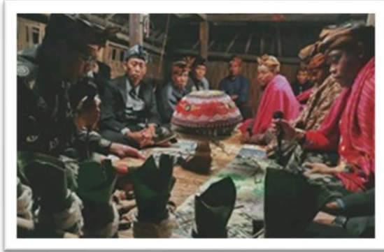
Figure 3. Recitation of Lontar Jatiswara

These stages' festive and spiritual atmosphere reflect the communal and cultural significance of the Ngayu-ayu ritual. Figures 3, 4, 5, and 6 depict the ritual visually. This sequence highlights the rich cultural practices embedded in the Ngayu-ayu ritual, reflecting the deep connection between tradition, community, and the natural environment in Sembalun.