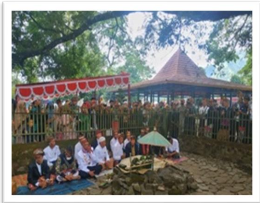
Figure 5. Laying of the 13 Sacred Springs