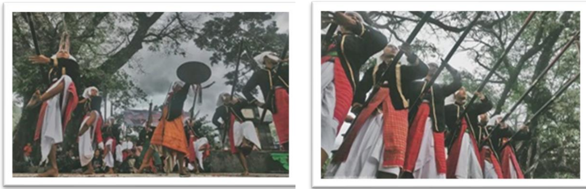
Figure 2. Tandang Mendet Dance

provided the rice seeds, suggesting that the Ngayu-ayu ritual could be performed to overcome the jinn. Following this advice, the people of Sembalun made ketupat (rice cakes) to throw at the jinn. After successfully subduing the jinn, they were instructed to slaughter a buffalo and two chickens as an offering to supernatural beings to ensure the salvation of nature. It marks the origin of the Ngayu-ayu ritual in Sembalun Village. Once security was restored, a spear dance encircling the graves was performed, followed by the Tari Tandang Mendet, a symbolic dance signifying the triumph and joy of defeating the jinn. The atmosphere of the Tandang Mendet dance can be observed in Figure 2.