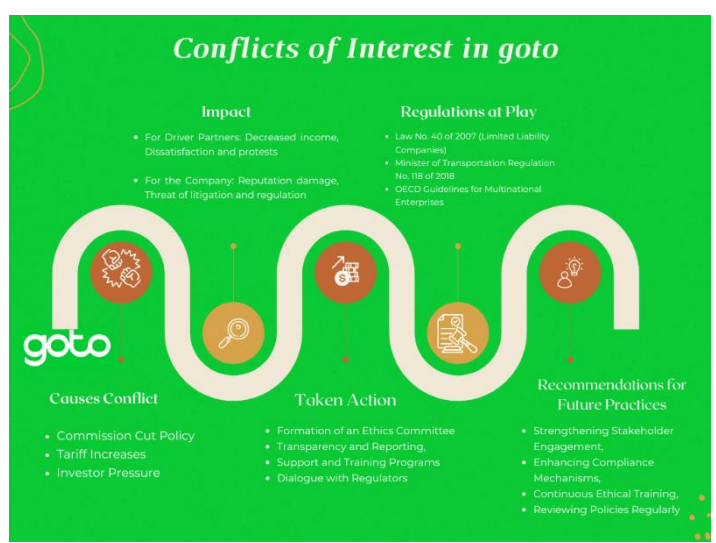
Figure 3. Conflict of Interest in GOTO

The legal regulations applied in conflict resolution at GOTO reflect the importance of balancing business interests and corporate social responsibility. Companies are expected to comply with existing rules, including in terms of transparency, accountability, and the welfare of work partners, to create a more ethical and sustainable business environment, if simplified in a flowchart as shown in the image below (Figure 3):