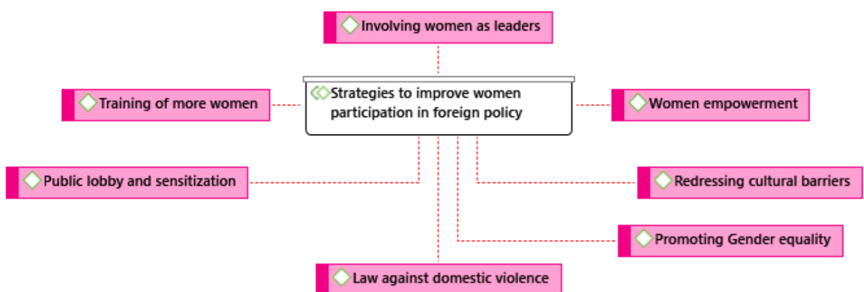
Figure 2: Strategies to improve women's participation in decision-making process

This section explored the strategies that could be adopted to improve women’s participation in foreign policy. This objective was included to opine measures to attract and increase the participation of women in the decision-making process. The responses from the participants are summarized in Figure 2: