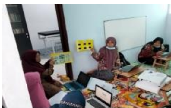
Figure 2. Example of visual support

Teachers' knowledge scale has a significance value in the range of .460 - .795, and it is declared valid. The scale reliability test used inter-rater estimation with Interclass Correlation Coefficients (ICC). Furthermore, teachers' knowledge instrument containing ten items shows an alpha value of .701. The pretest-posttest data are calculated by statistical analysis of the Wilcoxon signed rank test and effect size using the SPSS 22.0 for Windows program.