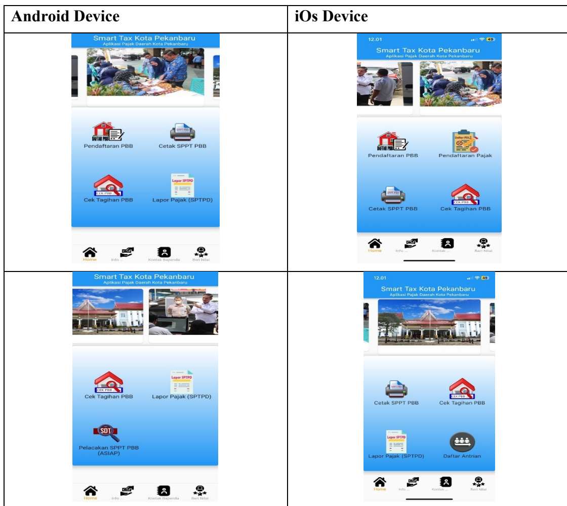
Figure 2 Local Tax Services Available on the Smart Tax Pekanbaru Application on Android and iOS Devices

objectives. The smart tax pekanbaru application is an innovation created by BAPENDA Pekanbaru City as a forum for several applications based on the pekanbaru local tax service website, such as PBB registration, registration of other local taxes, printing PBB bills, printing PBB SPPT, reporting taxes (SPTPD), and tracking PBB SPPT. These local tax services are actually only local tax collection processes carried out by BAPENDA Pekanbaru City without local tax payments. To fulfill the local tax collection process, BAPENDA Pekanbaru City conducts further cooperation with banks to innovate and develop technology in local tax services. So that in the smart tax pekanbaru application there is a payment feature through banking and / or non-banking.