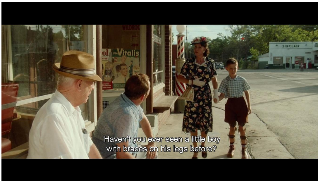
Picture 1. People were so strange about Forrest Gump's walk and the devices on his feet that they looked at him with strange looks. Timestamp: 6:24

Radway's theory of ideal romance formula (1982) can be used to examine the moment in Forrest Gump where people were so strange about Forrest Gump's walk and the devices on his feet. According to this idea, romance books and films often follow a formula or pattern where the hero's social identity is destroyed. Forrest Gump had to wear special gadgets on his feet to help him walk while he was growing up in Greenbow, Alabama. People would frequently stare and give him strange glances as a result of the equipment he was using to walk differently than other children his age. Forrest was perplexed as to why his gait caused people to regard him differently. He didn't want to be assessed just on the basis of how he looked because he knew that on the inside, he was just like everyone else.