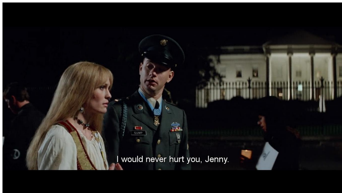
Picture 9. Forrest Gump put sweet words on Jenny and said that he would not hurt Jenny. Timestamp 1:09:57

flowers, and a passionate moonlight dance. Jenny was moved by Forrest's straightforward and sincere affection and became aware of her own feelings for him. Despite Jenny pushing him away, Forrest's love for her was unwavering, and he never gave up on her. In the end, their love was the only thing that remained consistent in their life, and it gave them both a sense of tranquility and happiness they had never experienced before.