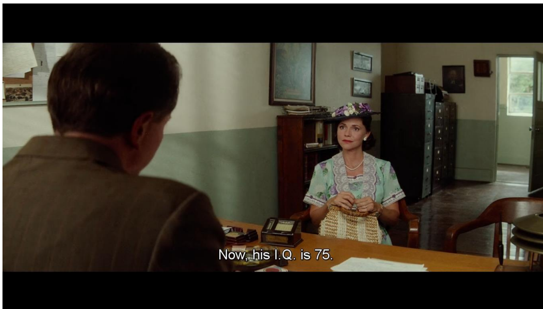
Picture 2. When Forrest Gump wanted to enter his favorite school, the principal told his mother that Forrest Gump had a very low IQ. Timestamp: 7:38