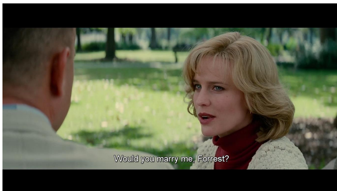
Picture 10. Jenny expressed her desire to marry Forrest Gump after the various difficulties they faced, they finally lived together. Timestamp: 2:04:38

Throughout history, romance has been examined in literature, movies, music, and other forms of art. That is a feeling that all individuals, regardless of their culture or upbringing, can relate to. There is a structure that most romantic stories follow, where one of the roles played by either the guy or the woman is to declare their love for one another. This technique is frequently used in well-known films and television programs where the male protagonist must win the female protagonist's love, or vice versa. The two protagonists eventually get together in a pleasant and romantic climax, even though the process can be drawn out and difficult and full of difficulties.