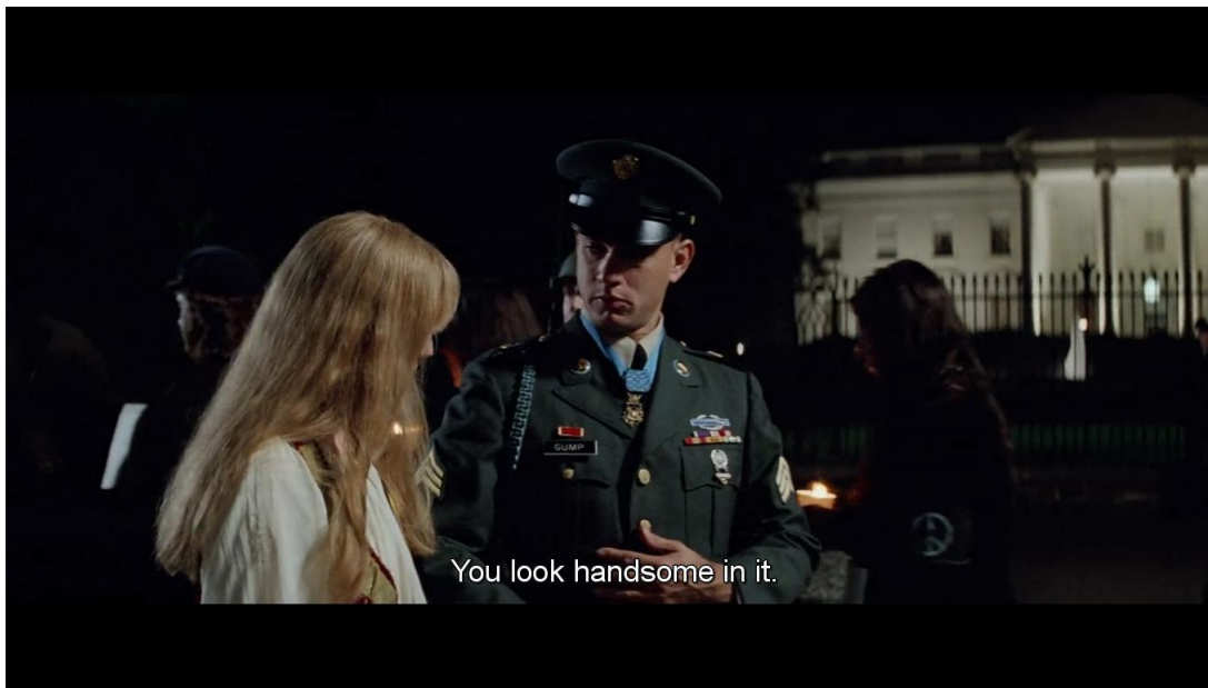
Picture 8. On the night when Forrest and Jenny are walking around the White House, Jenny compliments Forrest on his good looks in a soldier's uniform. Timestamp 1:10:22

Radway's theory of ideal romance formula (1982) can be used to examine the moment in Forrest Gump where Jenny complimented Forrest handsome. According to this idea, romance books and films often follow a formula or pattern where the heroine responds warmly to the hero's act of tenderness. Jenny couldn't help but be pleased of Forrest as they passed through the revered hallways of the White House because he was dapper in his sharp American military outfit. She was impressed by how the uniform displayed his strong shoulders and chiseled features because it fit him so well. Although she had always thought Forrest was gorgeous, at that precise moment, she was overcome by a deep adoration and love for him. Jenny couldn't help but gush over Forrest's attractiveness. In response to Jenny's remarks, Forrest reddened while experiencing a rush of pride and joy.