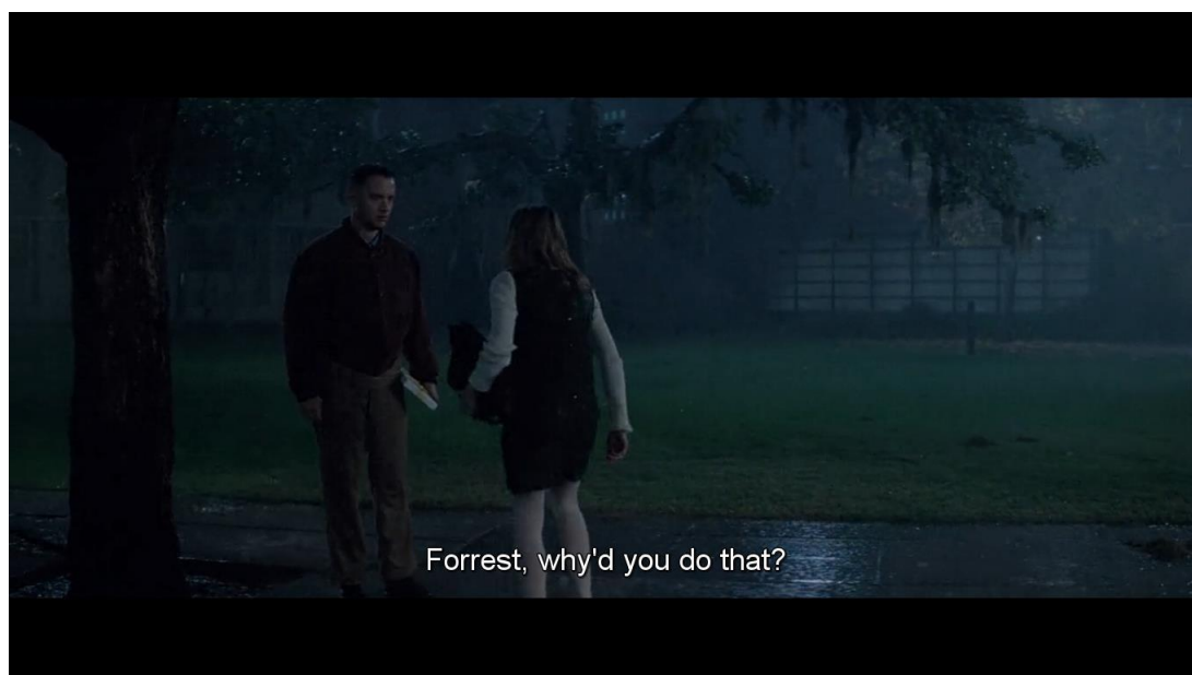
Picture 6. Jenny scolds Forrest for his innocence when he hits Billy on the sidelines where Jenny and Billy are having a date in the car. Timestamp 26:26

As a person who has a very low IQ and other limitations, Forrest Gump does not have the same character as people in general, he tends to be innocent and do things based on what he believes. This often made Jenny angry, moments like when Forrest hit Billy, Wesley, and when Forrest beat up the audience who tried to seduce Jenny, making Jenny feel annoyed and scold Forrest.