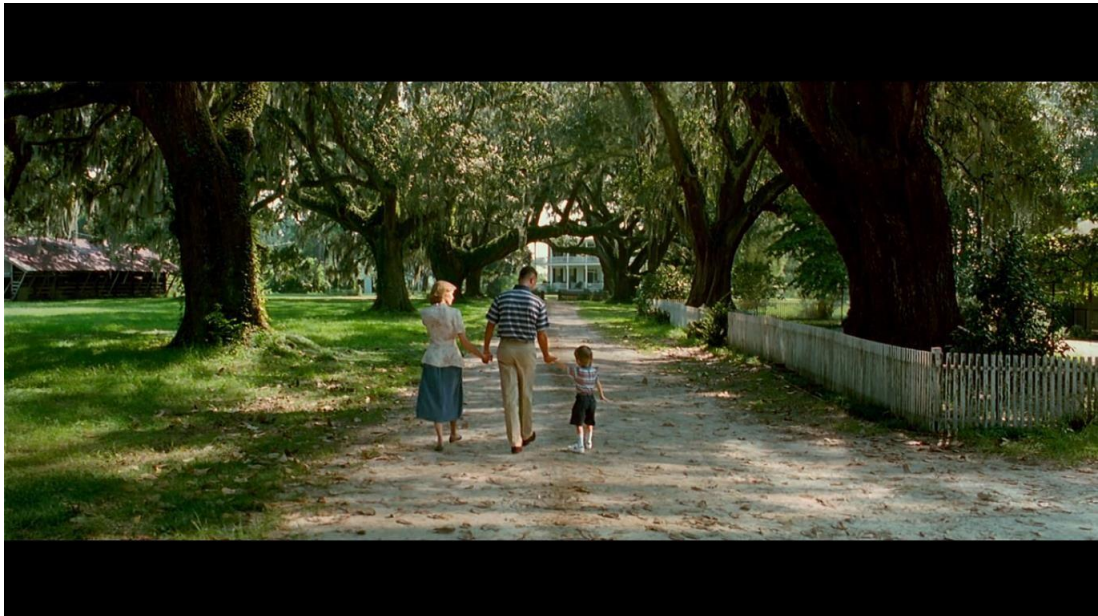
Picture 12. After facing various difficulties and obstacles in their respective lives, Forrest and Jenny finally managed to get through it all and live together.

never wavers, and they eventually locate one another and decide to live together. Despite these difficulties, Forrest and Jenny's love for one another provides constant solace and strength. They provide each other a sense of security and grounding, and their bond acts as a ray of hope for the entire movie.