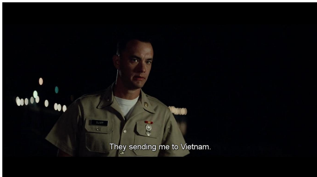
Picture 7. Forrest Gump told Jenny that he would be sent to Vietnam to take part in

The bond between Forrest and Jenny was never smooth. They had grown up together and had become inseparable over time. But, life had a way of interfering with their love. When Jenny got the chance to follow her dream of becoming a well-known singer, she had to leave Forrest behind. Though it was a challenging choice, she knew she had to make it. On the other hand, Forrest had other responsibilities. He had enlisted in the military and been assigned to the Vietnam War. Forrest through a terrifying ordeal and witnessed things that nobody ought to ever have to. But throughout it all, he never forgot about Jenny. He thought of her frequently and dreamed of the day he would see her again.