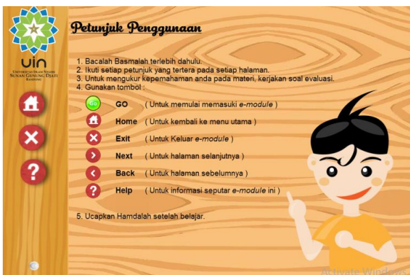
Figure 3. Instructions for Using the E-module

Instructions for use make it easier for readers to find it difficult or confused to run the e-module program (Wijaya et al., 2018). So that information is provided for the buttons used in the e-module. For example, the display of e-module usage can be seen in Figure 3.