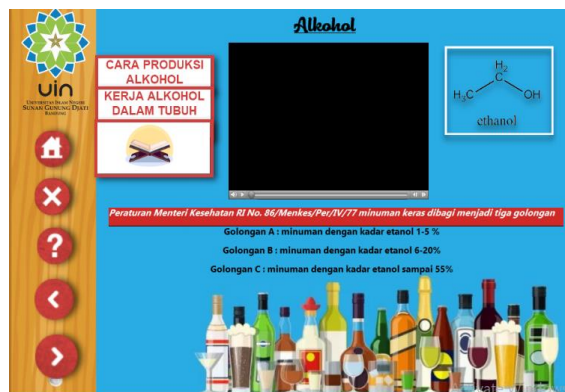
Figure 8. Display of E-module Content

Furthermore, alcohol is equipped with the ethanol structure, videos of the use of liquor in the community, and the classification of liquor based on its alcohol content. According to the minister of health regulation, the classification of liquor is divided into three groups, namely groups: A, B, and C. A display of e-module content is shown in Figure 8.