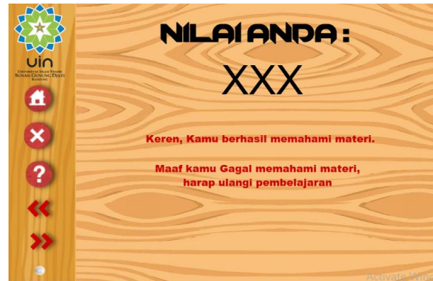
Figure 4. Learning Evaluation Questions Feedback

There are five knowledge questions to measure students' understanding of mastering learning material (Kurniawati, 2020). After students or readers have answered all the questions, they will be given feedback in the form of the scores obtained according to the answers that have been done and there will be corrections to the answers if there are wrong answers when working on the questions. The e-module feedback display can be seen in Figure 4.