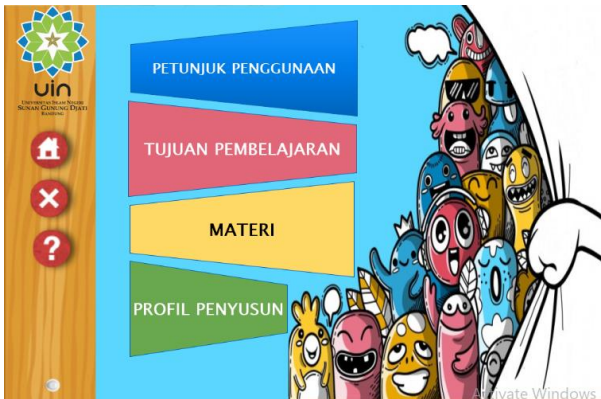
Figure 2. Table of Contents of the E-module