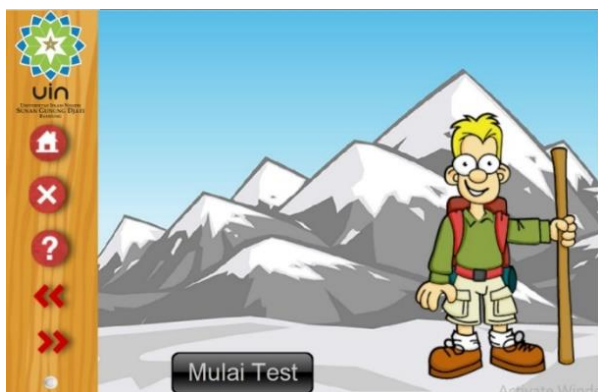
Figure 6. Cognitive Test

The display of the e-module material that has been corrected according to the validator's suggestions is as follows: