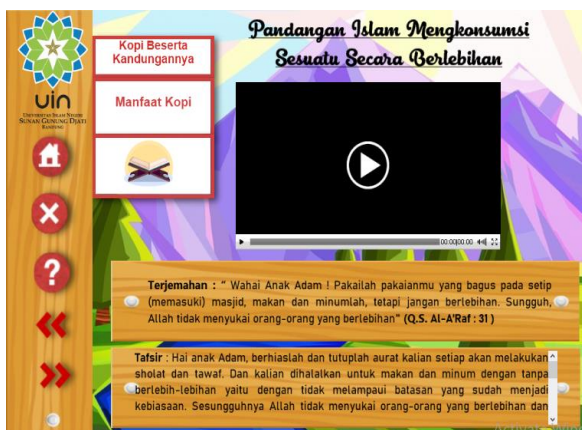
Figure 7. Display of E-module Content

Figure 7 shows a verse from the Al-Quran regarding the Islamic view of consuming something excessively contained in caffeine material. The Surah quoted is Al-A'raf verse 31, which is equipped with a translation and interpretation.