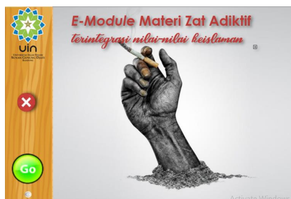
Figure 1. E-module Cover

On the cover, there is an identity that is contained in the e-module (Kurniawati, 2020). In addition, there is an e-module title for the topic of addictive substances integrated with Islamic values accompanied by a "Go" button that indicates to start learning on the next page. The cover display e-module can be seen in the Figure 1.